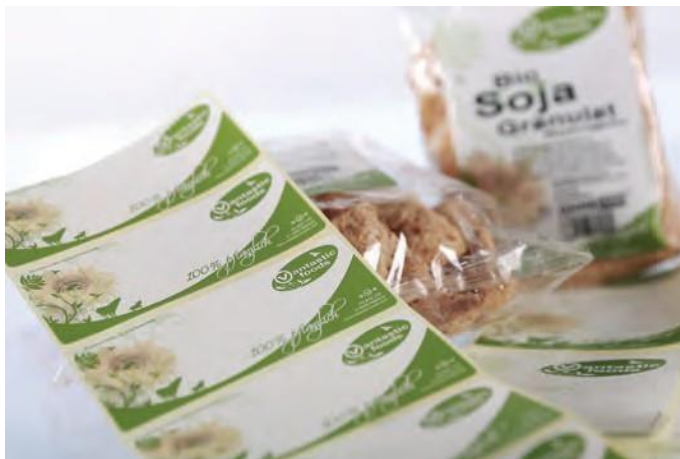
Self-adhesive pre-printed labels for bio products