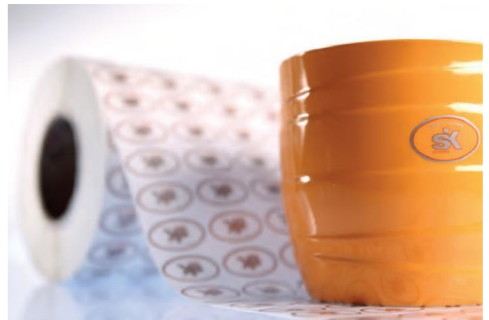
Self-adhesive brand label for ceramics