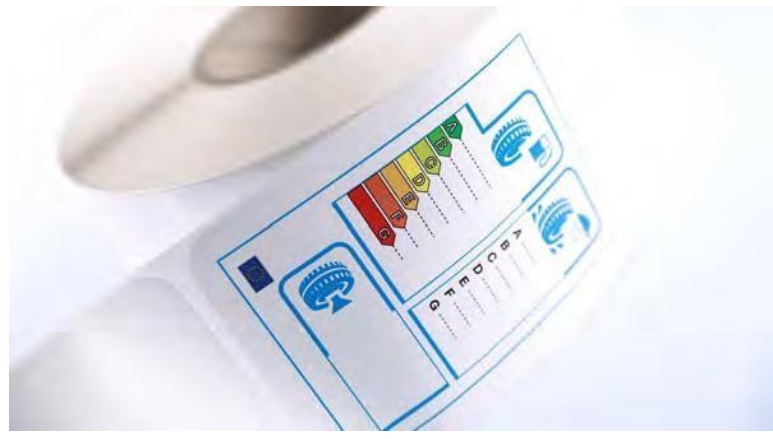
Self-adhesive label with special adhesive for labelling of tyres

We can offer you numerous labelling solutions to perfectly match your application. Label materials and adhesives are constantly improving through our innovations. Talk to us – we know the market better than most!