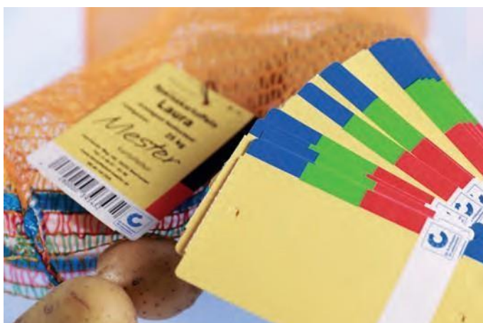
Cardboard tag for fruit and vegetables