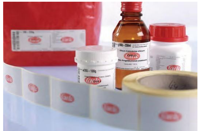
Self-adhesive pre-printed label for health products