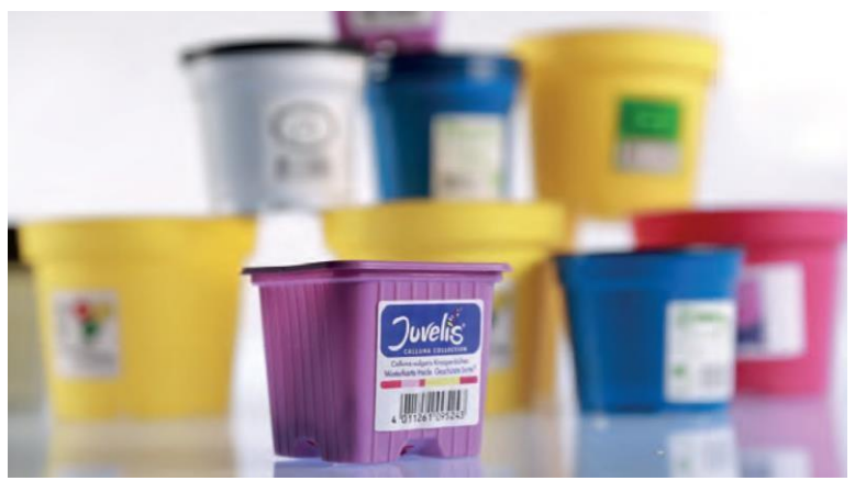
Self-adhesive identification labels for gardening