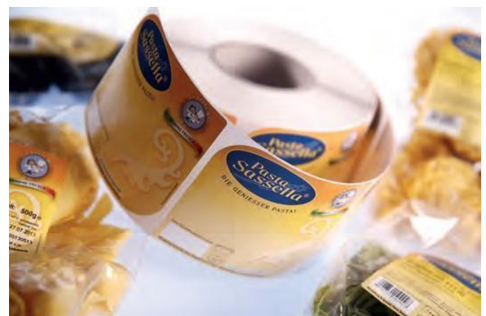
Self-adhesive shape-punched label for pasta